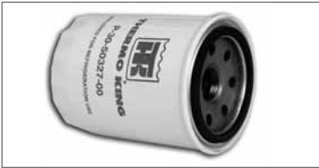
Description: FILTER OIL CS/12 Part number: 3504291 Cross reference: P-30-50327-00