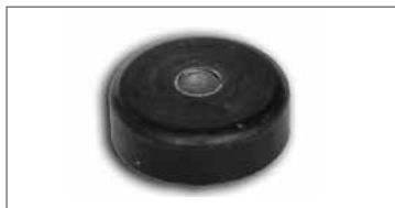
Description: MOUNT SHOCK Part number: 3502897 Cross reference: P-73-00096-00