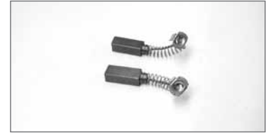
Description: BRUSH P/2 Use on Thermo King motor Part number: 3502645 Cross reference: P-54-60006-30PG