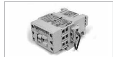
Description: CONTACTOR Part number: 3504124 Cross reference: P-10-00433-00