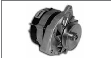
Description: ALTERNATOR Part number: 3504572 Cross reference: P-30-60050-03