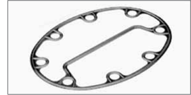
Description: GASKET H P6 Part number: 3501733 Cross reference: P-17-44124-00