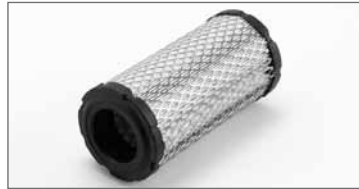
Description: FILTER AIR P1 Part number: 3504292 Cross reference: P-30-60049-20