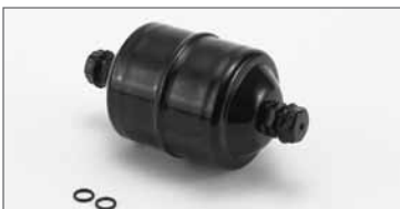
Description: DRIER Part number: 3504085 Cross reference: P-14-00326-04