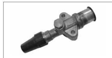
Description: VALVE SERVICE Part number: 3503686 Cross reference: P-14-01042-06