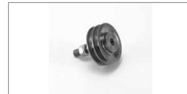
Description: PULLEY ASSY IDLER Part number: 3503473 Cross reference: P-50-60156-01