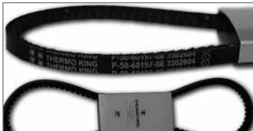
Description: BELT 35" Part number: 3502604 Cross reference: P-50-60197-06