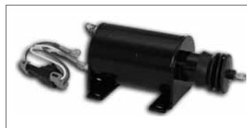
Description: SOLENOID Part number: 3504783 Cross reference: P-10-60018-00SV