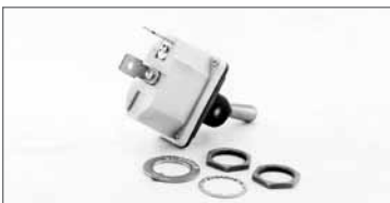
Description: SWITCH, TOGGLE Part number: 3501151 Cross reference: P-10-01129-02SV