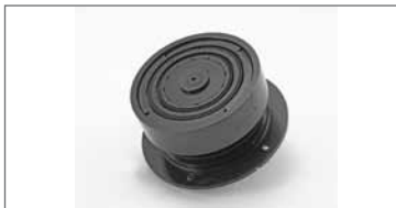
Description: CLUTCH ENGINE SUPRA 6/7 Part number: 3504868 Cross reference: P-50-01165-01