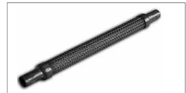
Description: VIBRASORBER Part number: 3502921 Cross reference: P-73-60010-00