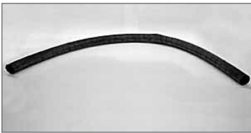
Description: HOSE, RADIATOR Part number: 3502727 Cross reference: P-58-60039-00SAV