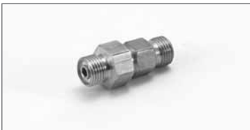
Description: VALVE CHECK , 1/4" Part number: 3503162 Cross reference: P-14-60026-00