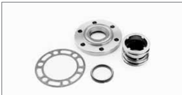
Description: SEAL SHAFT 05G COMP Part number: 3504264 Cross reference: P-17-44145-00