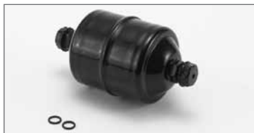
Description: DRIER FILTER Part number: 3504353 Cross reference: P-14-00326-05