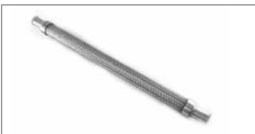
Description: VIBRASORBER Part number: 3502922 Cross reference: P-73-60010-02