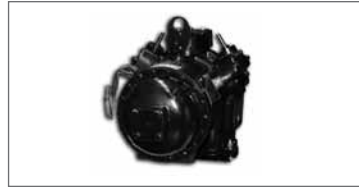
Description: COMPRESSOR 06D REMAN Part number: 8350193 Cross reference: P-18-00069-01RM