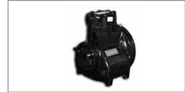
Description: COMPRESSOR REMAN Part number: 8350172 Cross reference: P-18-60000-04RM