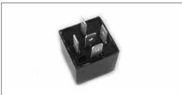
Description: RELAY 40A Part number: 3501090 Cross reference: P-10-00286-04