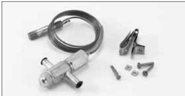
Description: VALVE TXV Part number: 3501486 Cross reference: P-14-00190-03