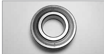
Description: BEARING FAN Part number: 3501020 Cross reference: P-04-60008-29