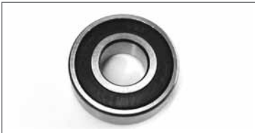
Description: BEARING Part number: 3501002 Cross reference: P-04-00018-00