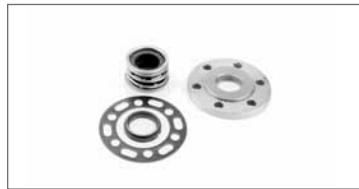
Description: SEAL COMP Part number: 3501748 Cross reference: P-17-44740-00