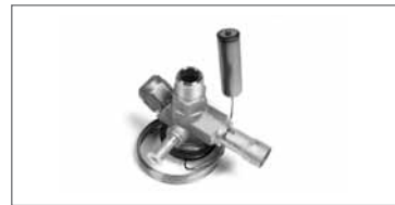
Description: VALVE EXPANSION Part number: 3504141 Cross reference: P-14-60039-00