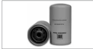
Description: FILTER OIL CS/12 Part number: 3504287 Cross reference: P-30-00450-00