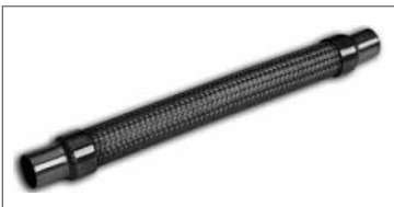
Description: VIBRASORBERSUPRA 6/7 Part number: 3502871 Cross reference: P-7102273