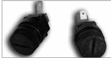
Description: BRUSH P/2 Use on OE motor Part number: 3502646 Cross reference: P-54-60006-30