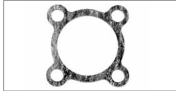
Description: GASKET P10 VALVE SUC Part number: 3501661 Cross reference: P-17-40005-05