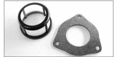
Description: FILTER 70U Part number: 3502311 Cross reference: P-30-01080-20