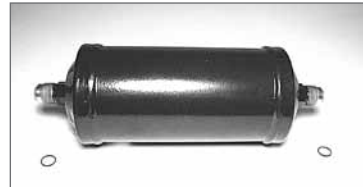
Description: DRIER FILTER SINGLE Part number: 3501498 Cross reference: P-14-00209-00