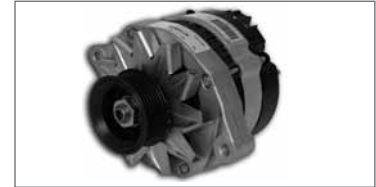
Description: ALTERNATOR Part number: 3504668 Cross reference: P-30-60050-07