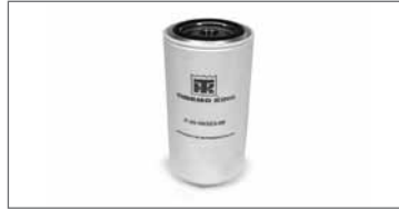
Description: FILTER OIL CS/12 Part number: 3504286 Cross reference: P-30-00323-00