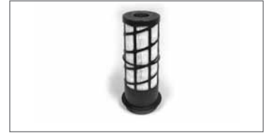
Description: FILTER AIR P1 Part number: 3503950 Cross reference: P-30-00426-20