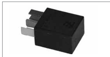
Description: RELAY Part number: 3501140 Cross reference: P-10-00385-00