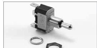
Description: SWITCH, TOGGLE ON/ OFF/ON MOMENTARY Part number: 3503690 Cross reference: P-10-01129-16SV