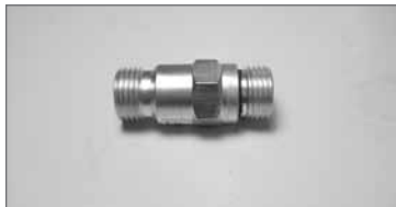
Description: VALVE CHECK , 3/8 Part number: 3501597 Cross reference: P-14-60026-01