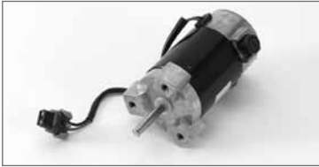
Description: MOTOR EVAP Part number: 3504672 Cross reference: P-54-60006-13-B