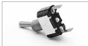
Description: SWITCH, TOGGLE Part number: 3501156 Cross reference: P-10-01129-10