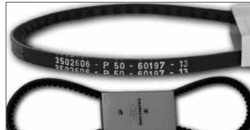
Description: BELT Part number: 3502606 Cross reference: P-50-60197-13