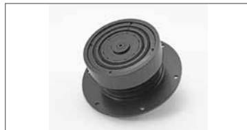
Description: CLUTCH ENGINE SUPRA 9 Part number: 3504869 Cross reference: P-50-50051-04