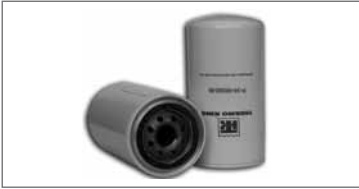
Description: FILTER FUEL CS/12 Part number: 3504284 Cross reference: P-30-00302-00