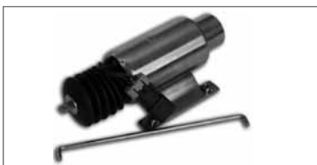
Description: SOLENOID LINEAR PUSH Part number: 3504780 Cross reference: P-10-01178-04SV