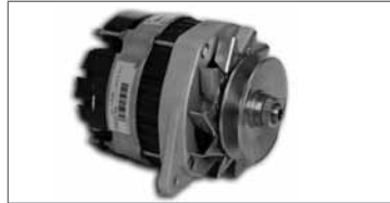
Description: ALTERNATOR 70A Part number: 3502345 Cross reference: P-30-60050-04