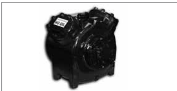
Description: COMPRESSOR RM 05K MAXIMA Part number: 8350183 Cross reference: P-18-00063-31RM