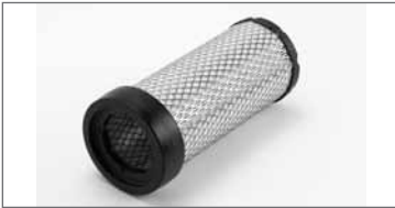
Description: FILTER AIR P1 Part number: 3503996 Cross reference: P-30-00430-23