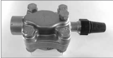
Description: VALVE, SERVICE Part number: 3501660 Cross reference: P-17-40002-01